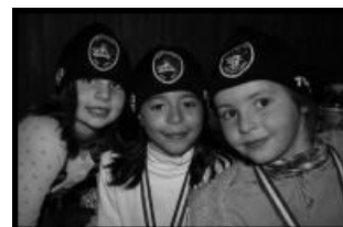
Some happy skiers after the PA Jr. Nordic Races, February, 2010

season starts with an info session and dryland training in December - look for more details online at www.paccca.org/yellowjackets