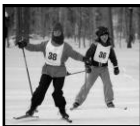
Yellowjackets make us proud at the Rochester Youth Ski Festival, January, 2010

Yellowjackets had representatives at races in NY, OH, MI and of course PA. We enjoyed a very snowy ski camp on PA race weekend with Ohio Nordic's Hilltoppers, and an adventure day at Wilderness hosted by the Wildcats, and helped share our love of xc skiing with the Winterfest crowd at Ohiopyle.