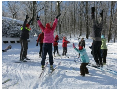
Yellowjackets youth program