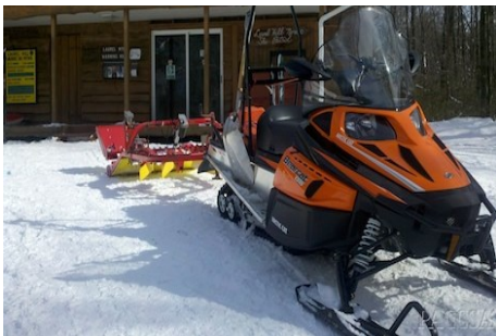
Laurel Mountain grooming equipment

Pennsylvania Nordic Championships – This annual fundraiser is the premier racing event for Nordic skiers throughout Pennsylvania and the surrounding region.