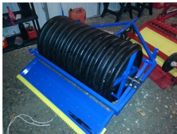
PACCSA's Roller/Compactor for low-snow grooming

At Laurel Ridge, PACCSA teamed up with the Laurel Ridge Concession to purchase a new wireless router. The new router provides improved wi-fi speed and range for visitors located within the two warming huts. It has also improved the stability and reliability of images from the Laurel Ridge Webcam.