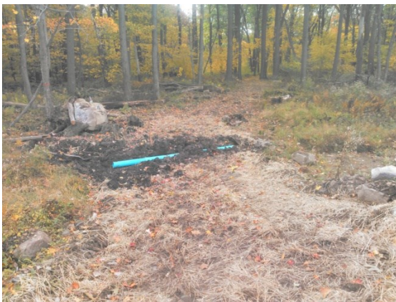
New trail construction at Laurel Mountain

In addition, PACCSA Volunteers worked with DCNR to create a new trail at Laurel Mountain that connects the cross country trails to the newly re-opened alpine center. The new trail allows cross country skiers access to food and other amenities available at the Laurel Mountain Alpine Lodge. This effort involved the removal of numerous trees, the creation of needed drainage, and proper grading of the trail's surface. In conjunction with this work, major improvements were made to the Bill Alberts trail, which provides access to the new connector. To access the new trail, simply follow Bill Alberts until you're almost at Locust Camp. Take a right onto the connector, go up a short hill, and follow the edge of the snowmaking reservoir. You'll then enter an open field that takes you to the Alpine Lodge.