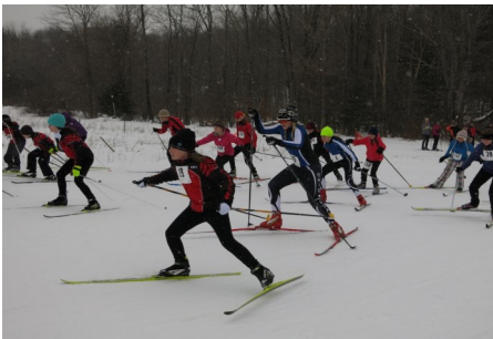
Kid's 3k Skate, PA Nordic Champs