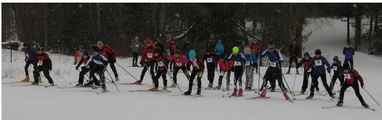
Kid's 3k Skate Mass Start, PA Nordic Championships