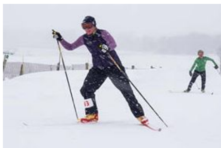
Racers at the 2014 Mountain State Marathon

To view our Webcams and find information about sking in our region, check out our website!