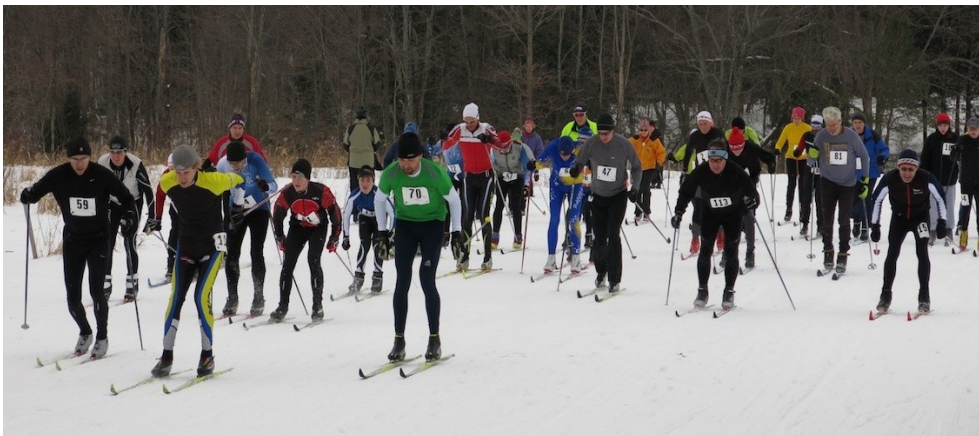
2014 PA Nordic Championships, 5.5k Classic Race Start

Snow can be a "hit-or-miss" proposition in Western Pennsylvania, but the 2013/2014 season has been outstanding. Mother nature has brought us plenty of snow, and for the first time in recent memory, every scheduled local ski race went off without a single cancellation. If you love to go fast on Nordic skis, or simply enjoy fun competitions with friends, this has been the winter for you.